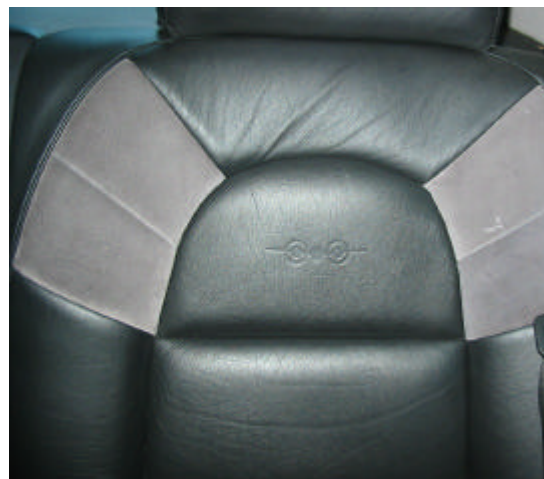
Above: Anniversary models had either Sand beige or Rocky black interior trim. Note embossed logo.