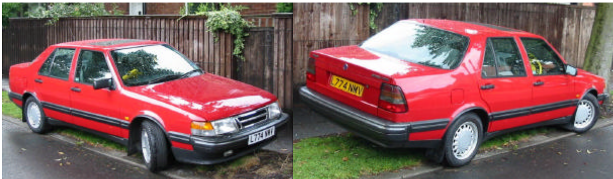
Above: The CD saloon. This car is a 1994 model year 2.3 CDE full pressure Turbo

An alternative body style appeared in 1989, in the form of the CD, a booted 4-door saloon. It is possible that the SAAB marketing team were concerned that potential sales were being lost because buyers seeking a traditional saloon may have preferred instead offerings from Mercedes Benz or even Ford's Mk III Granada.