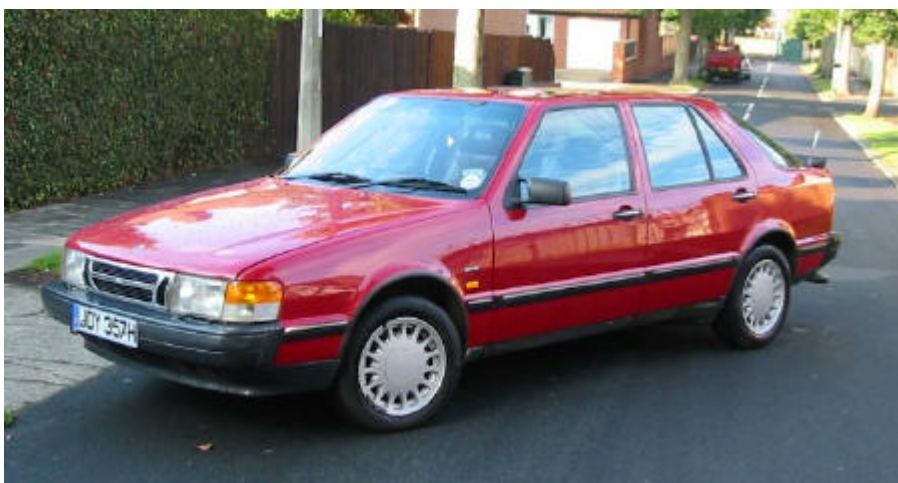
Above: the original 'flat front' shape 9000. This car is a 1990 2 litre Turbo manual.

Today, the 9000 range represents excellent value for money, as even the youngest cars are now four years old and many will have racked up impressive mileages. Traditionally, SAAB cars have quite steep initial depreciation – one dealer stated that this was largely because trade price guides were compiled from auction data and values reflect higher than average miles the cars could achieve in a year. Whether this is true or not is irrelevant – depreciation makes SAABs an excellent proposition for the second hand buyer.